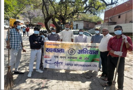
RO & Central Lab Parwanoo