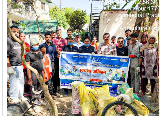
322131996, 75.6685845 Altitude: 12.39 m Apr 15, 2026 12:56:30 Note: Captured by Proof Cam