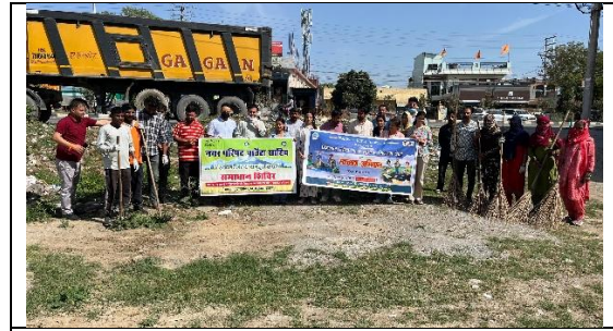
RO & Lab Paonta Sahib