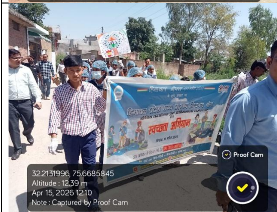
RO and Lab Dharamshala