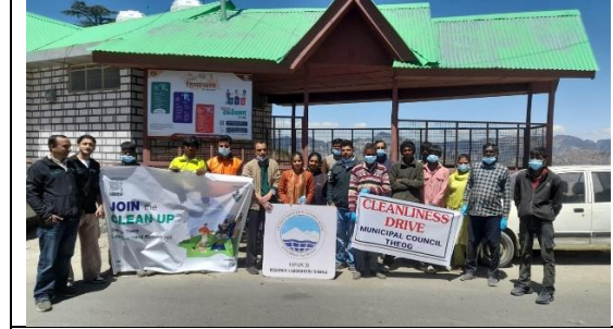
Regional Lab Shimla